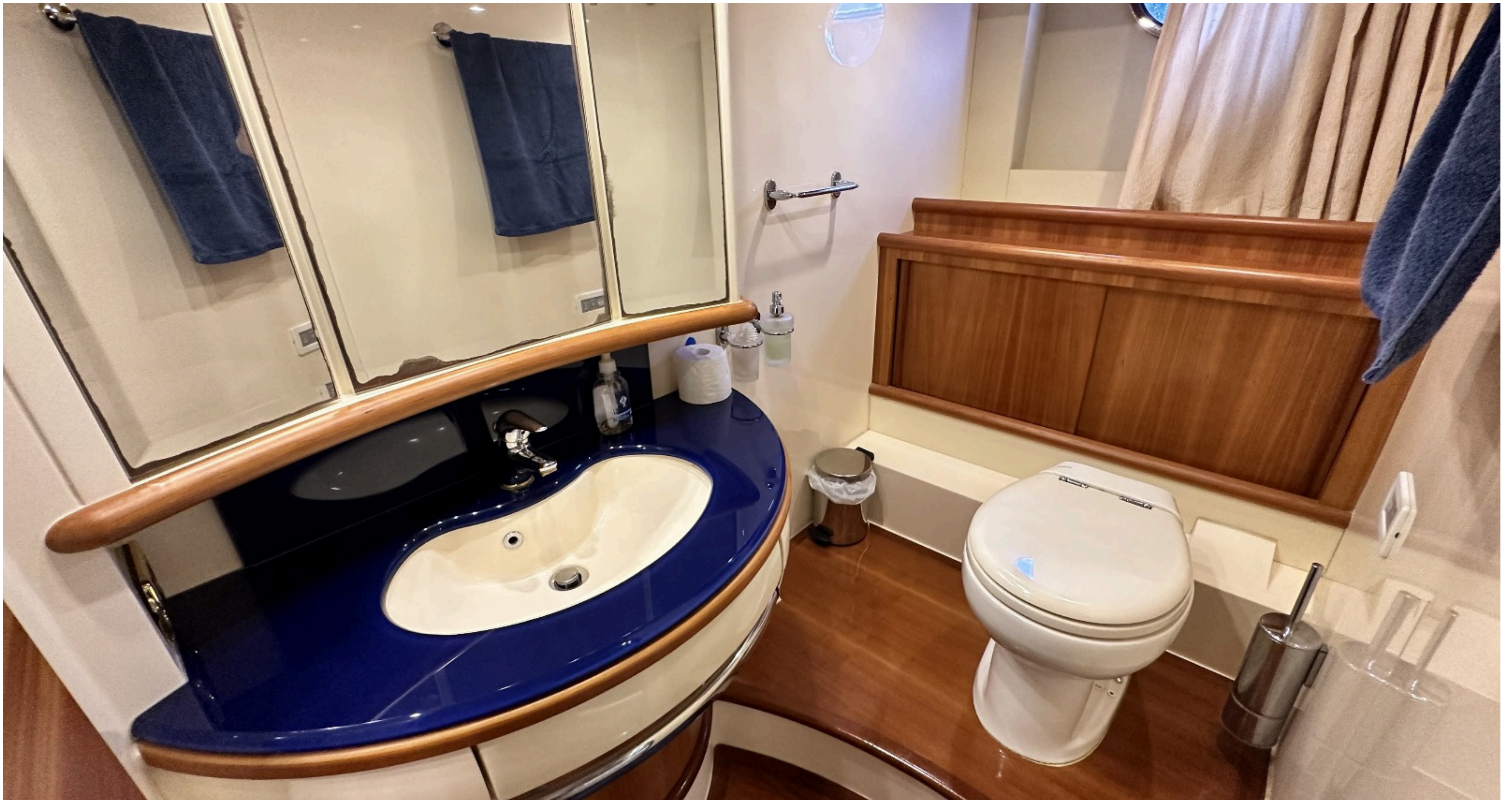
YACHT FOR CHARTER ~ L'Eclair III ~ 19.8M