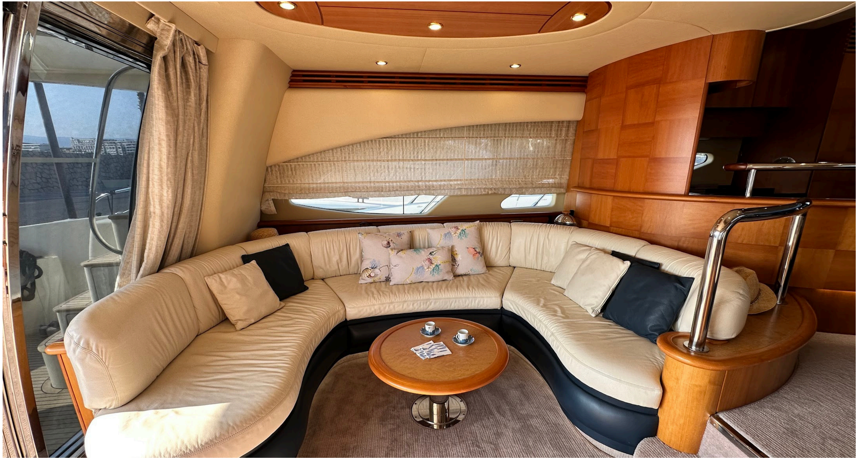
YACHT FOR CHARTER ~ L'Eclair III ~ 19.8M