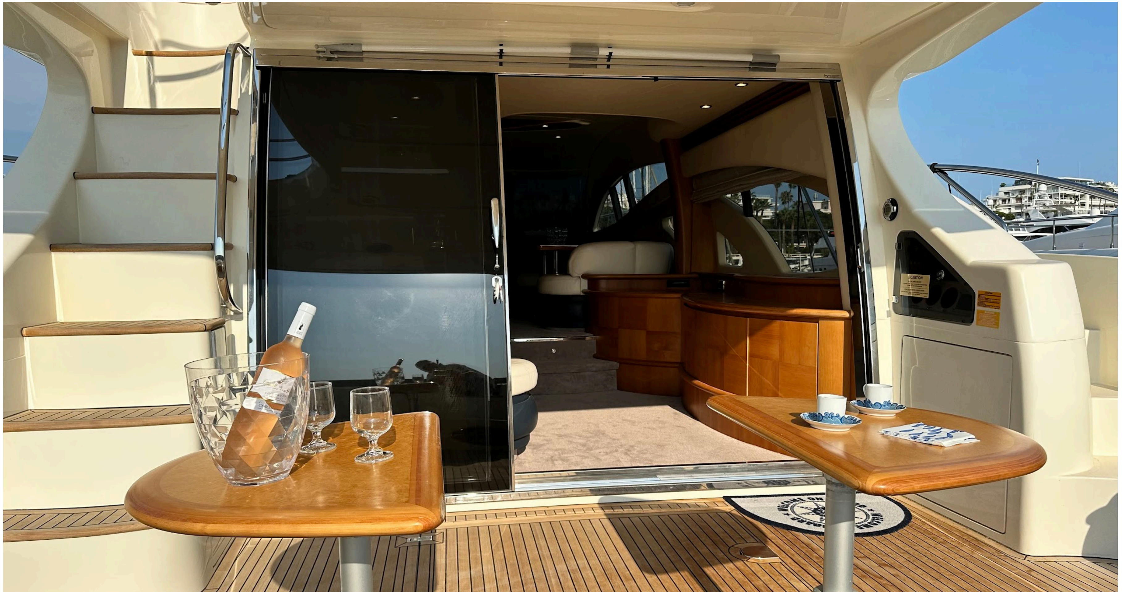
YACHT FOR CHARTER ~ L'Eclair III ~ 19.8M