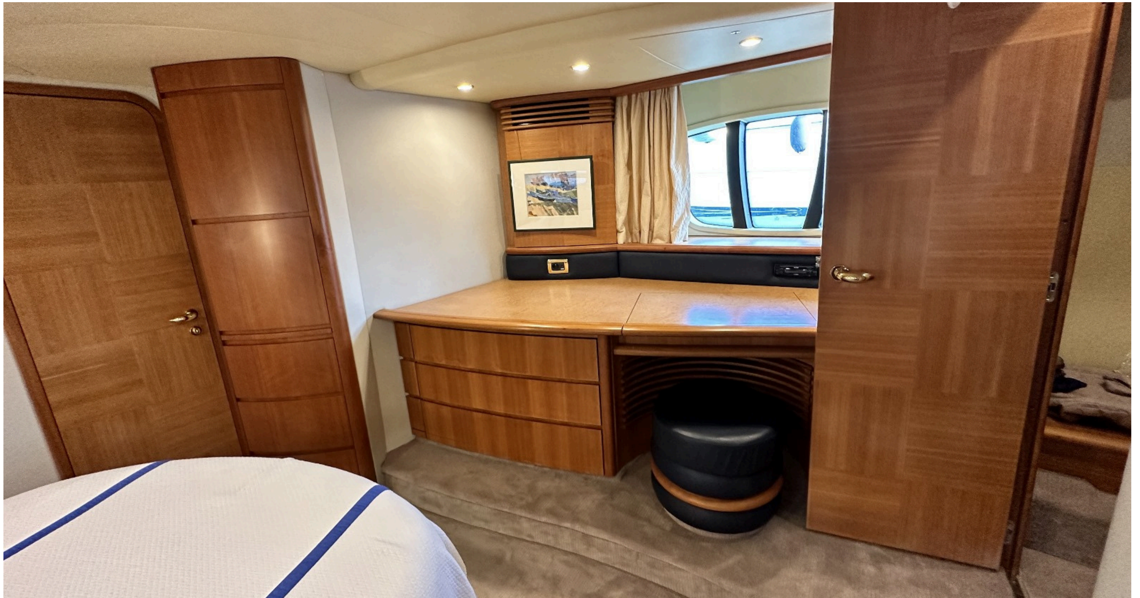
YACHT FOR CHARTER ~ L'Eclair III ~ 19.8M