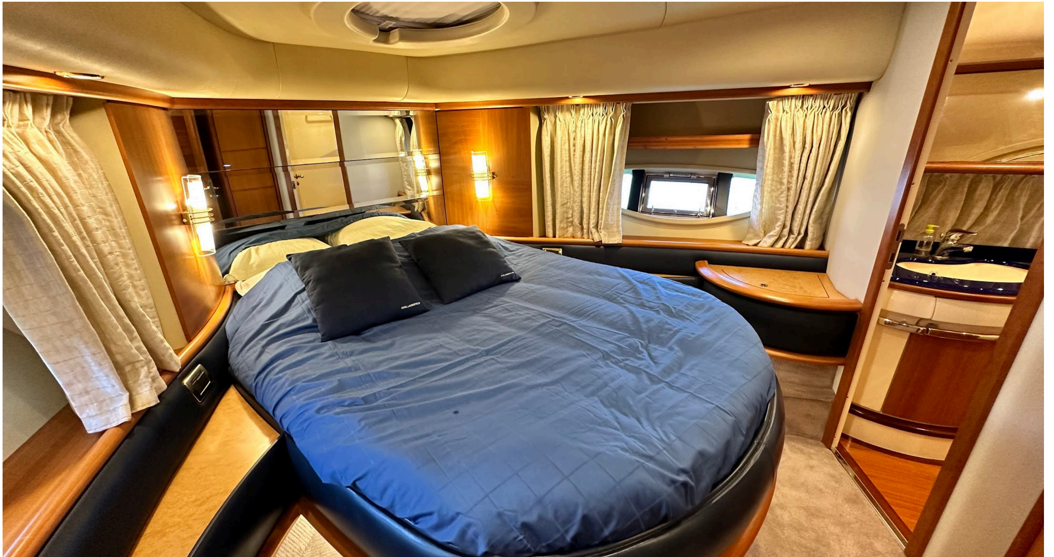
YACHT FOR CHARTER ~ L'Eclair III ~ 19.8M