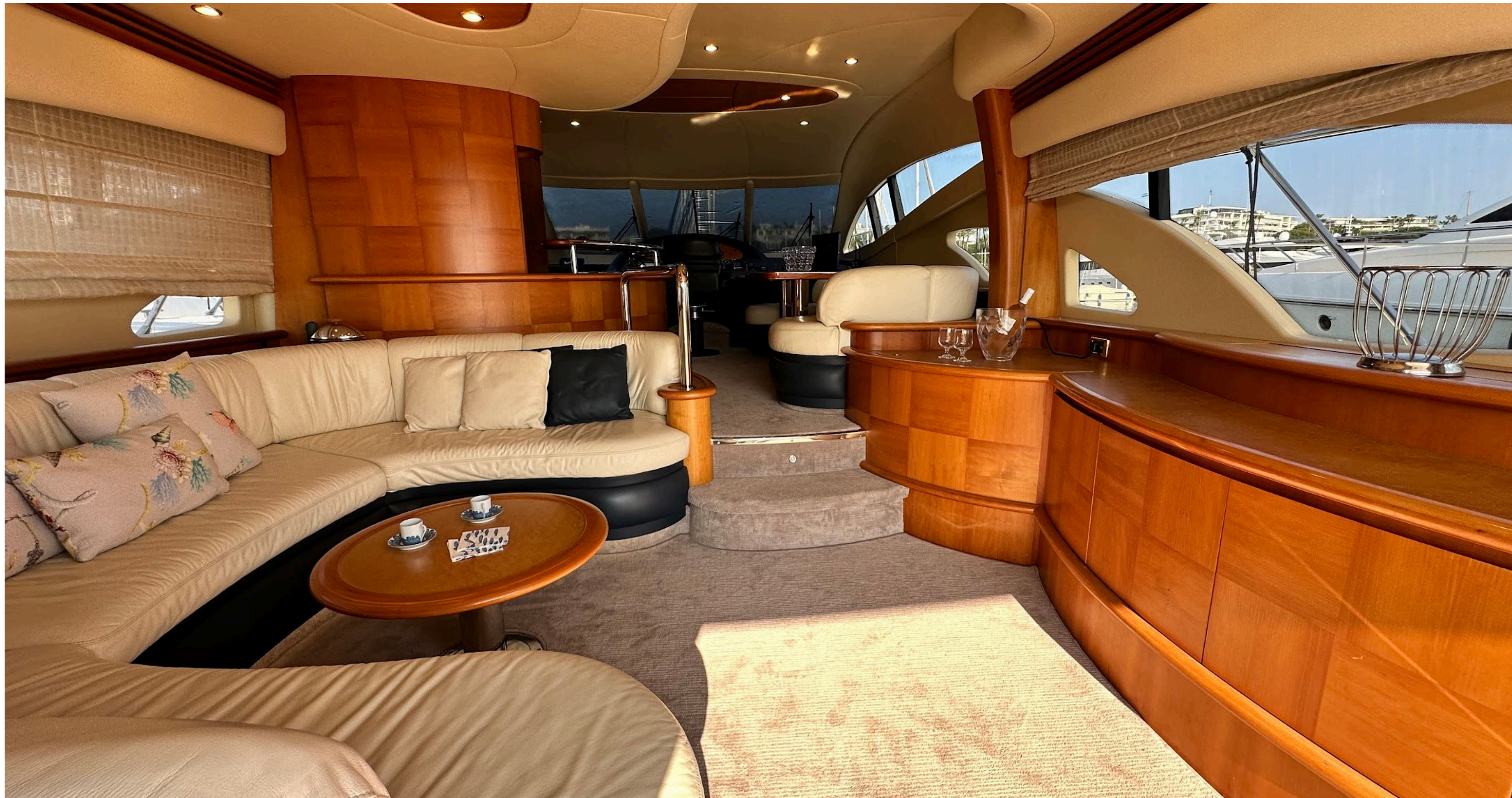
YACHT FOR CHARTER ~ L'Eclair III ~ 19.8M