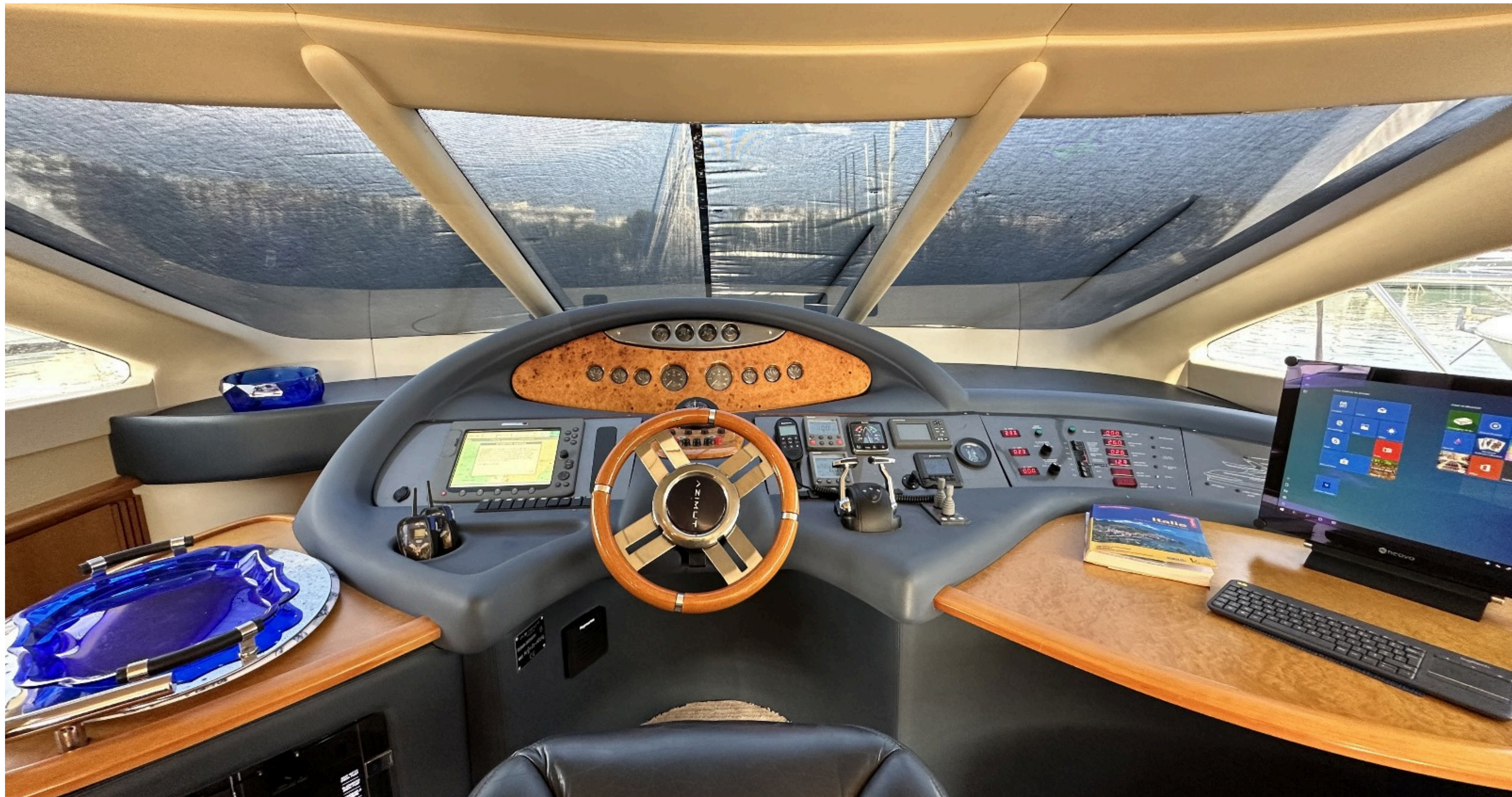
YACHT FOR CHARTER ~ L'Eclair III ~ 19.8M