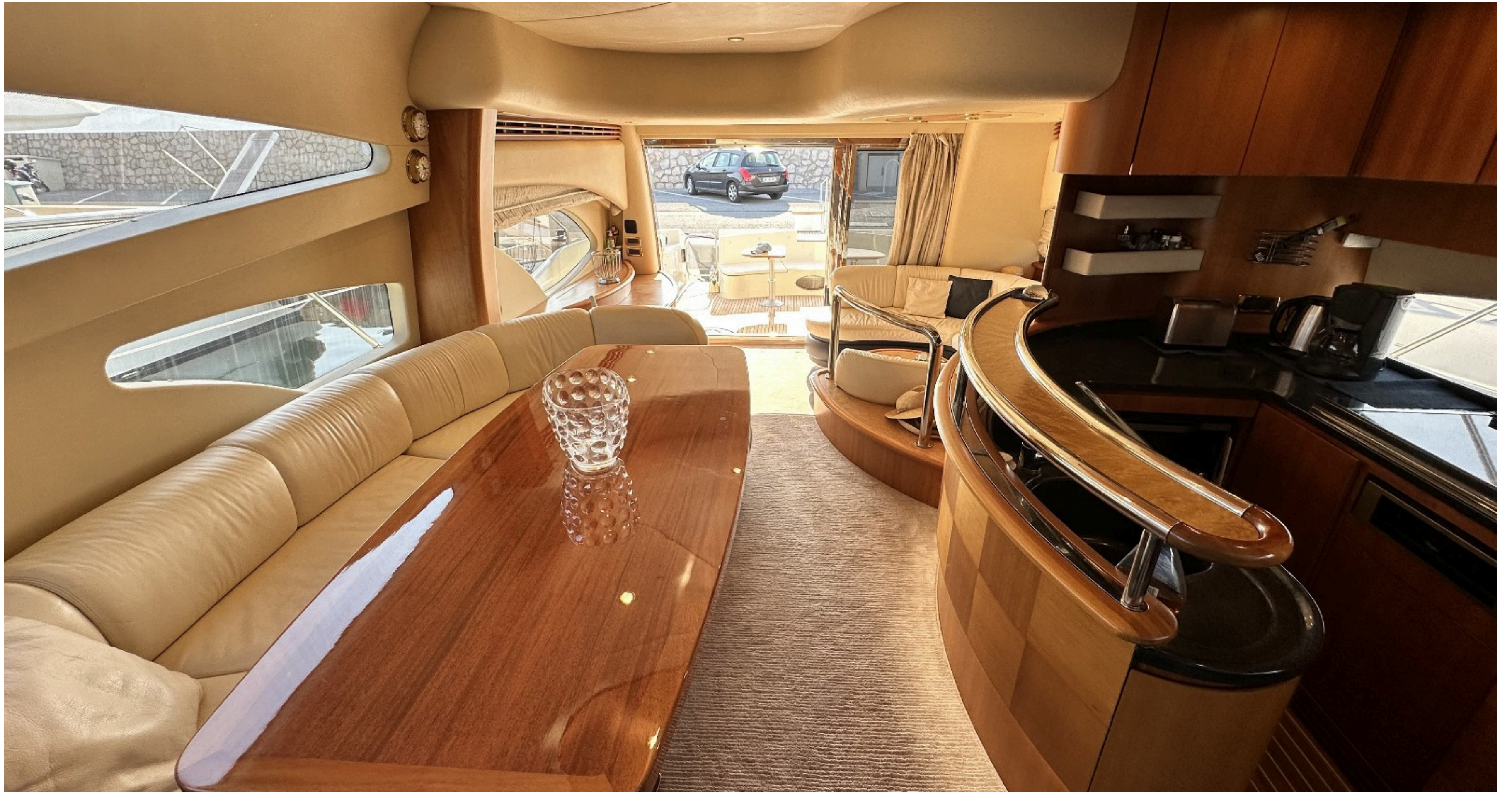
YACHT FOR CHARTER ~ L'Eclair III ~ 19.8M