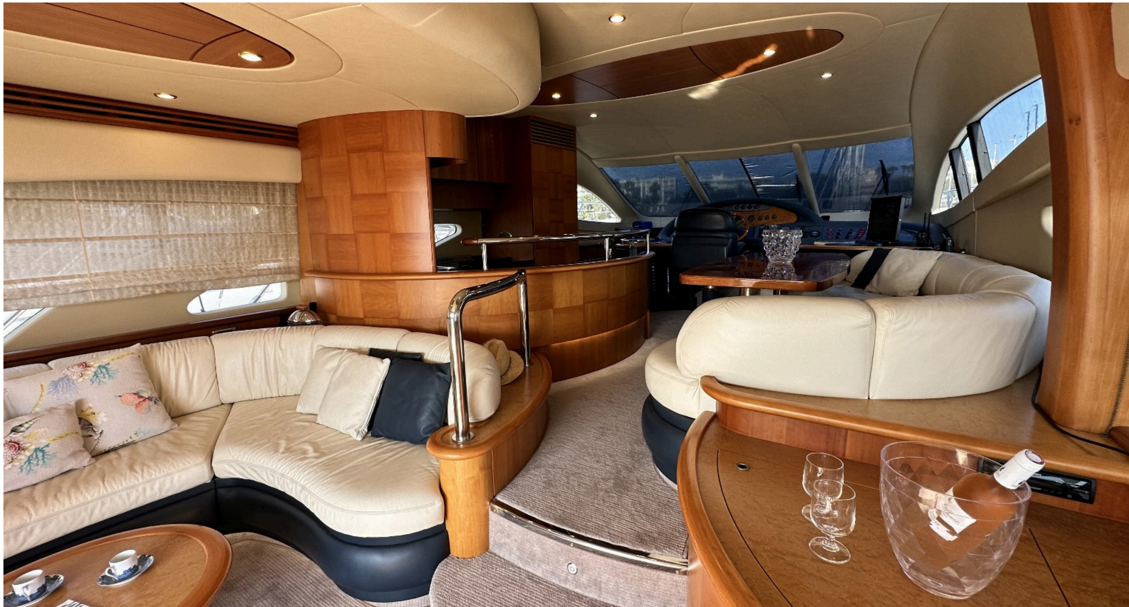
YACHT FOR CHARTER ~ L'Eclair III ~ 19.8M