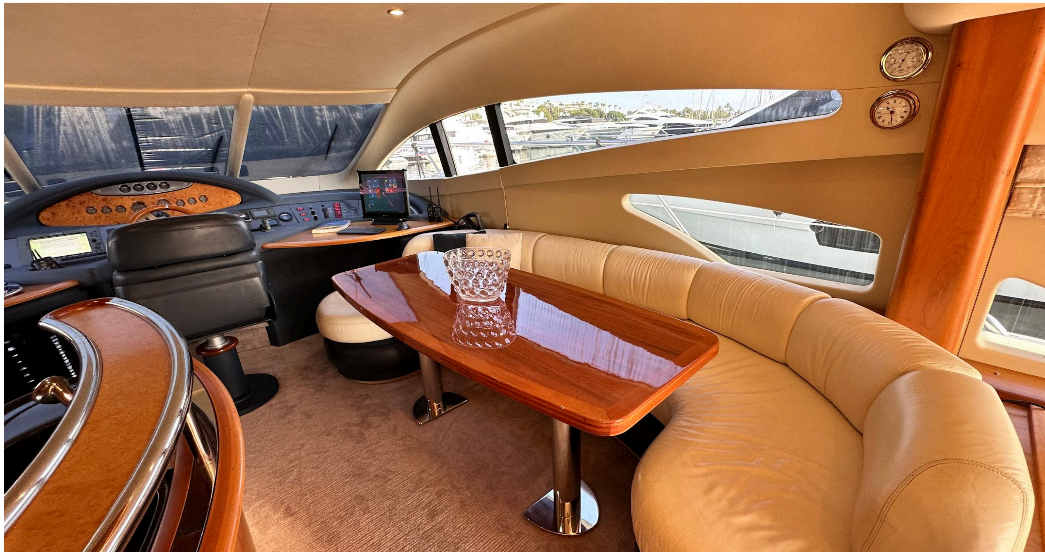
YACHT FOR CHARTER ~ L'Eclair III ~ 19.8M