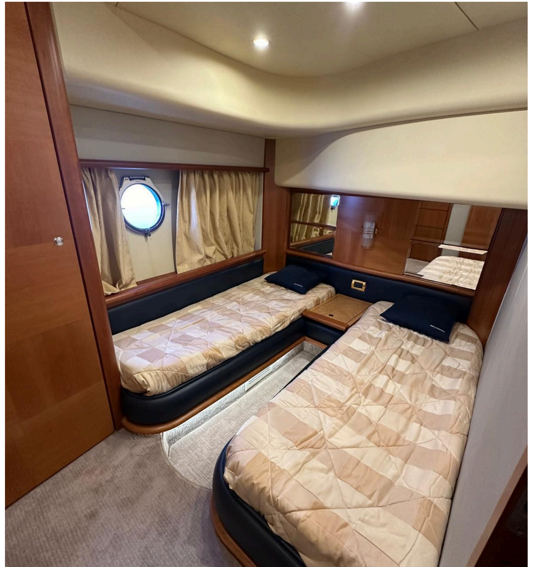
YACHT FOR CHARTER ~ L'Eclair III ~ 19.8M