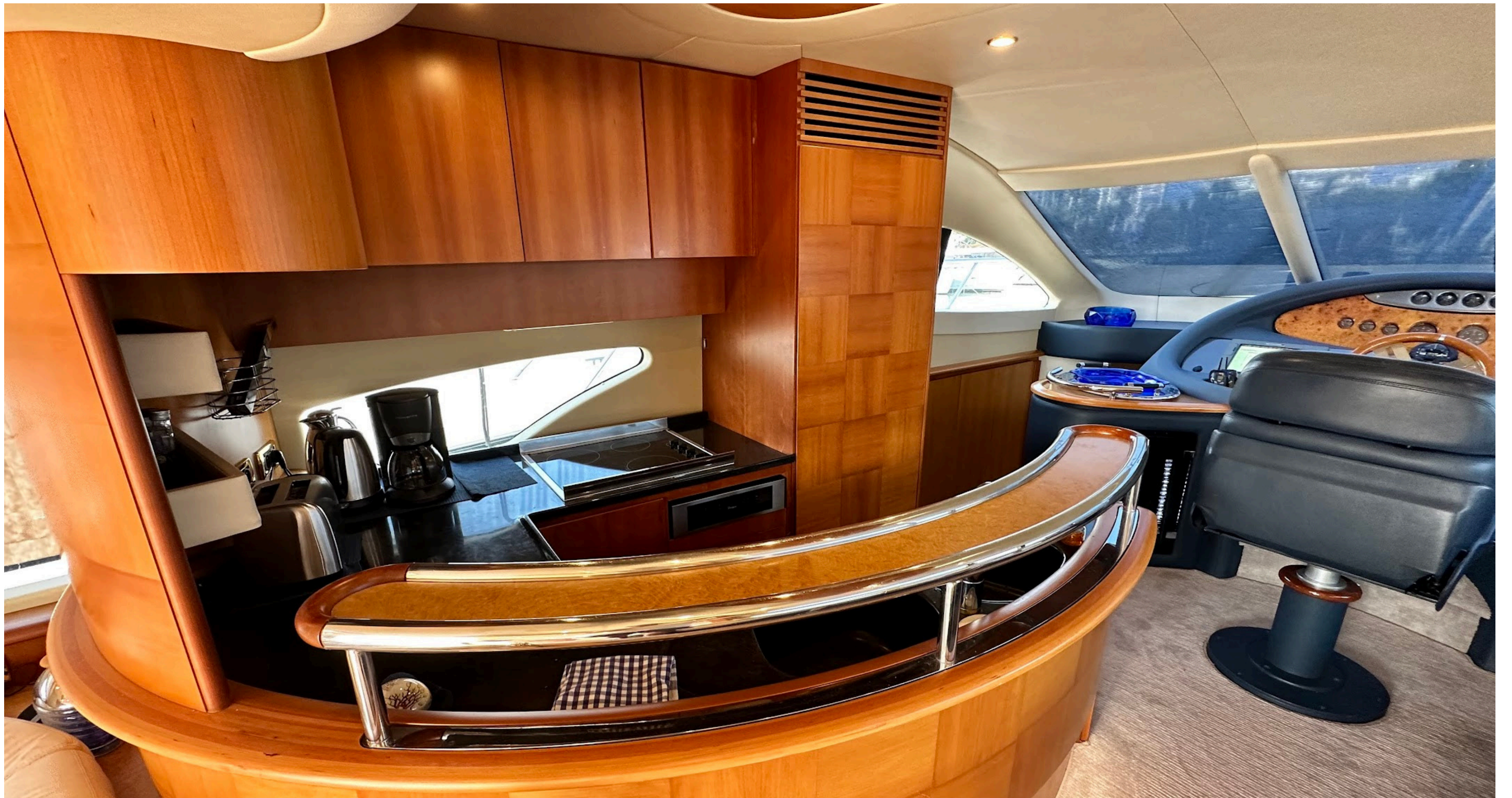
YACHT FOR CHARTER ~ L'Eclair III ~ 19.8M