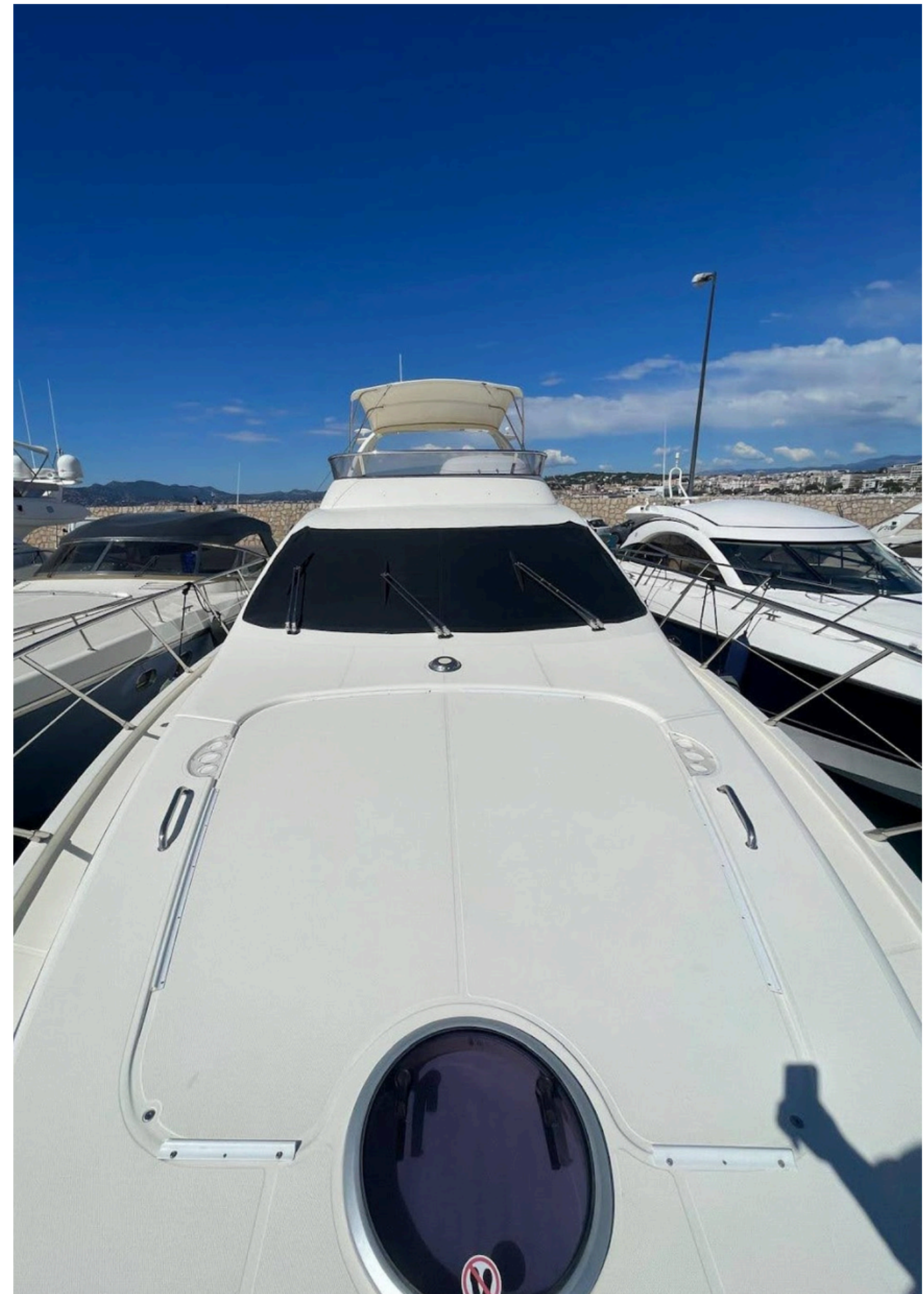
YACHT FOR CHARTER ~ L'Eclair III ~ 19.8M