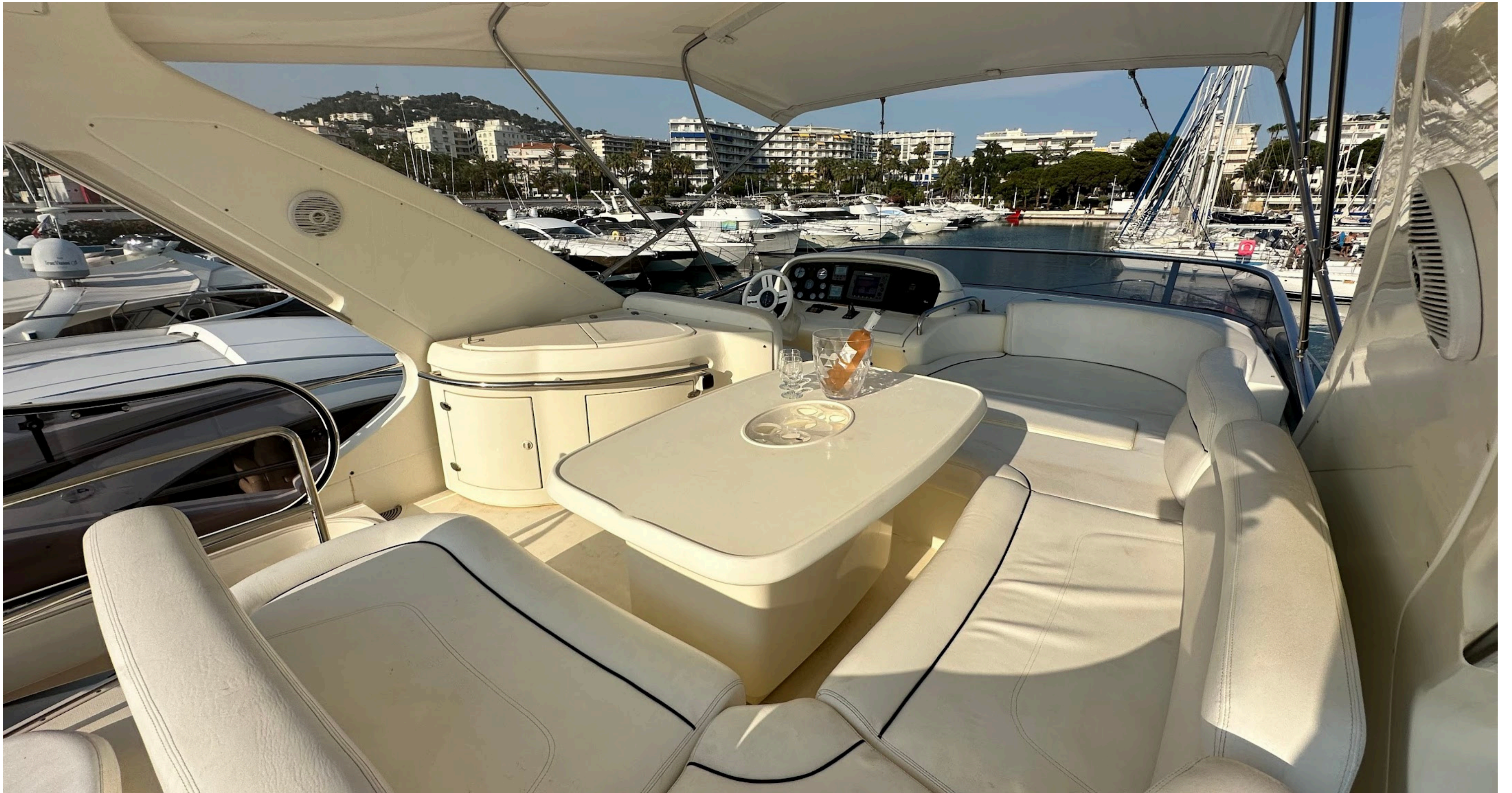
YACHT FOR CHARTER ~ L'Eclair III ~ 19.8M