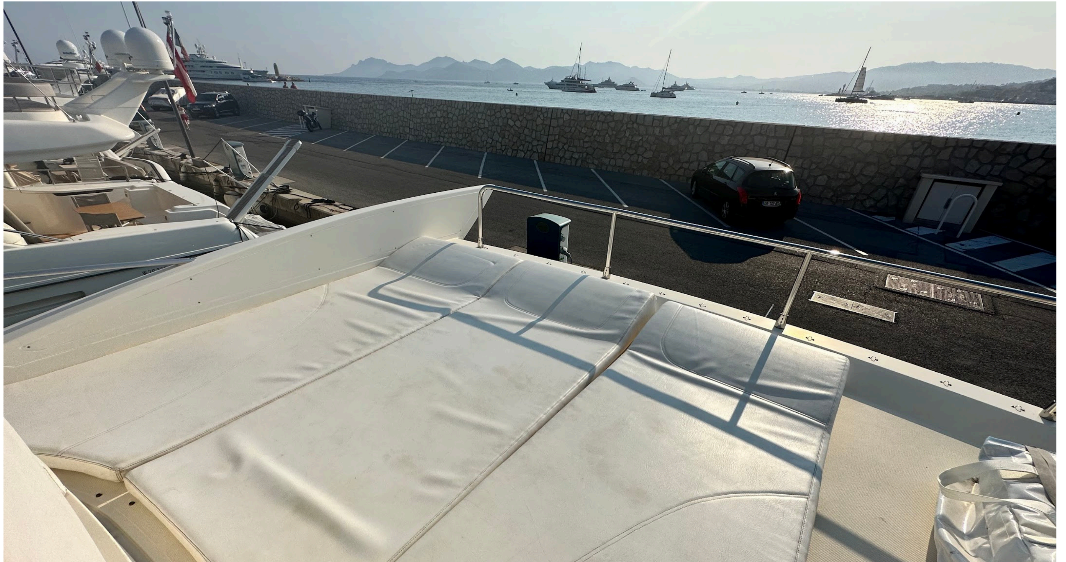
YACHT FOR CHARTER ~ L'Eclair III ~ 19.8M