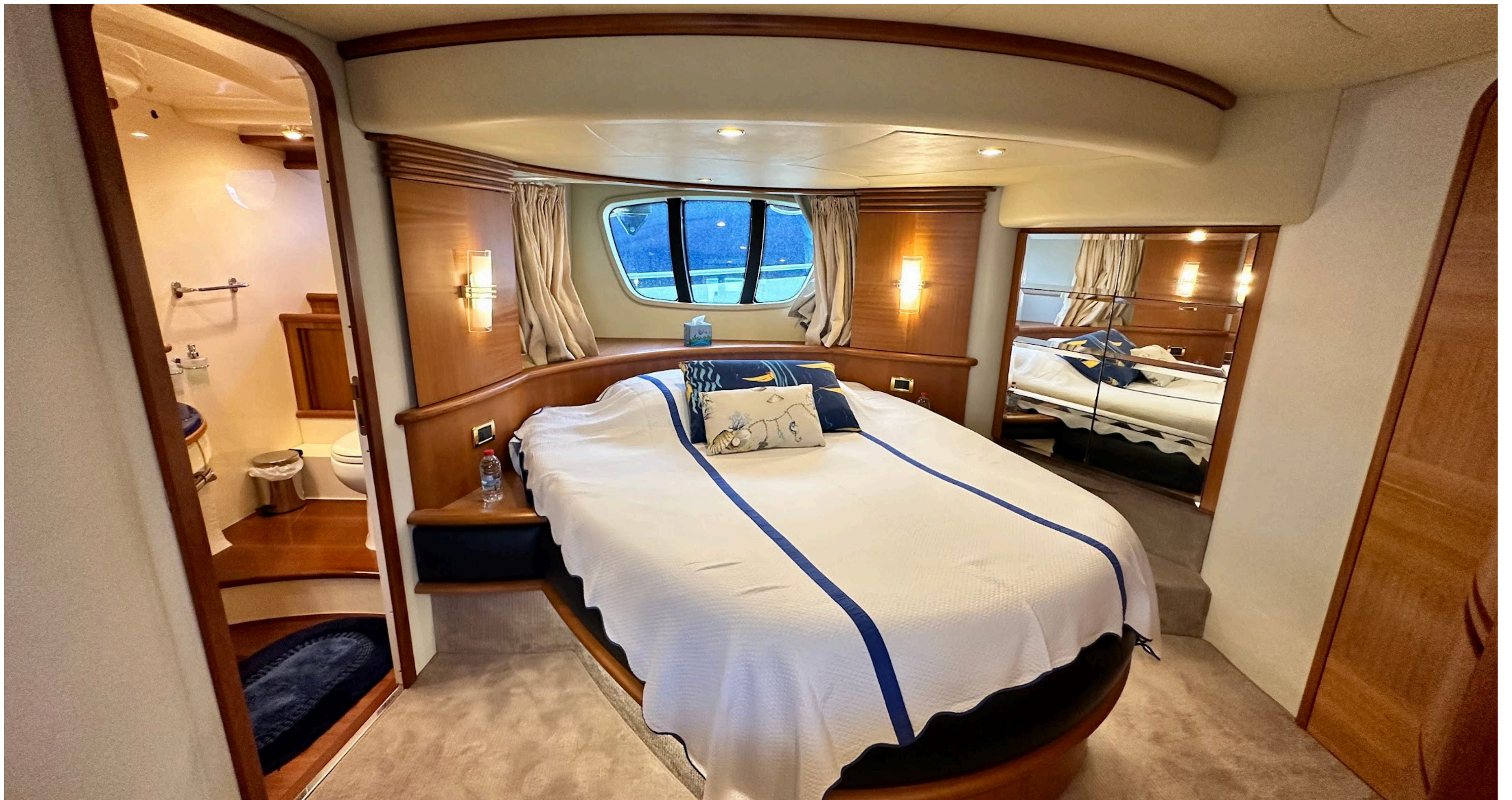
YACHT FOR CHARTER ~ L'Eclair III ~ 19.8M